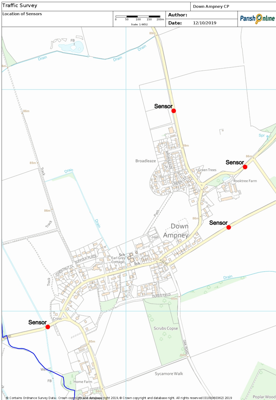
Figure 1 – Location of Traffic Sensors

A traffic survey was undertaken in September 2019. Sensors were placed on the road in locations shown on Figure 1.